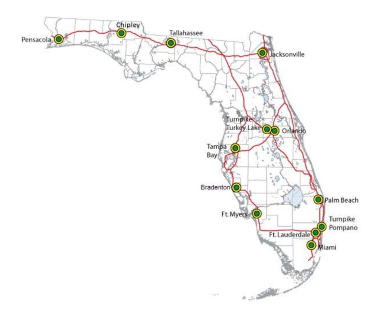
Figure 2: Florida Regional TMCs.

FDOT's RTMCs using the SunGuide software have amply demonstrated the capability of extending operations to include new software. This will require a SunGuide software modification to include a truck parking module to operate TPAS.