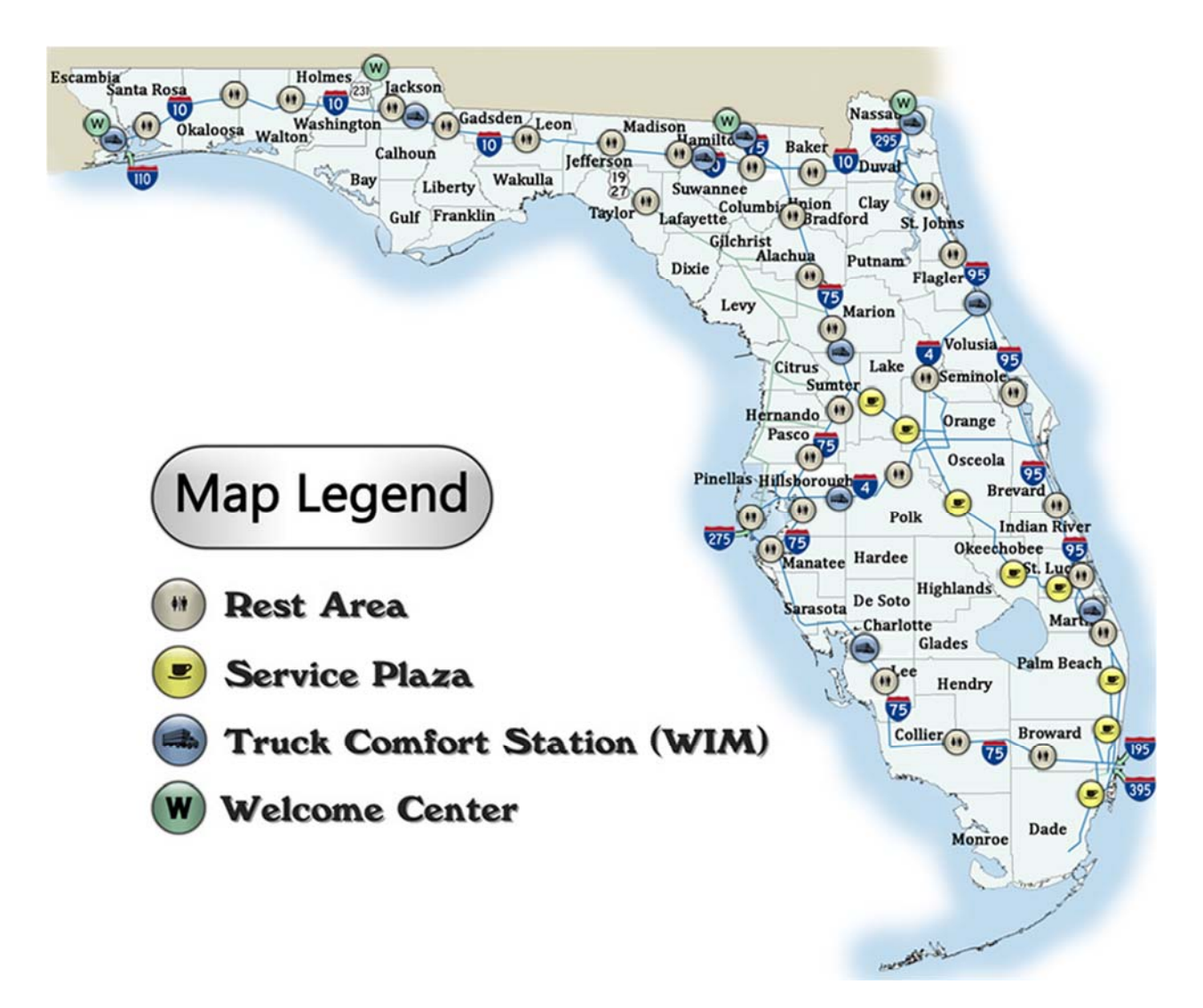
Figure 3: Map of Florida's Public Rest Areas.